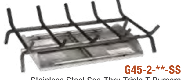
G45-2-**-SS Stainless Steel See-Thru Triple T Burners