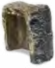
CHEC-1 Charred Valve Cover