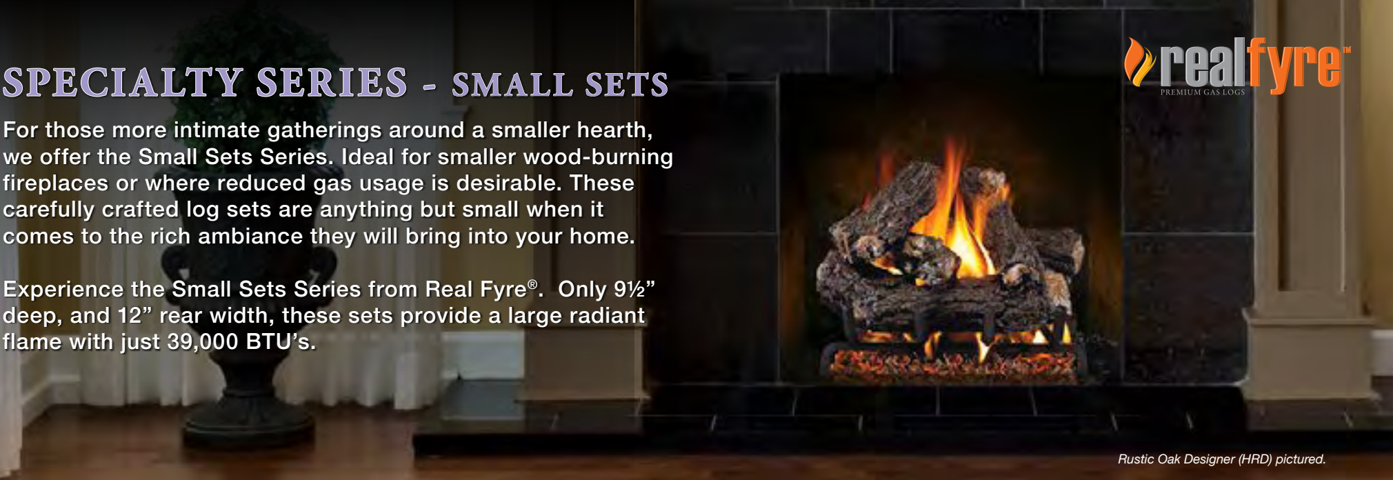
Rustic Oak Designer (HRD) pictured.