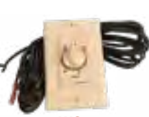
WS-2 Wall switch for log set, on/off control with timer.