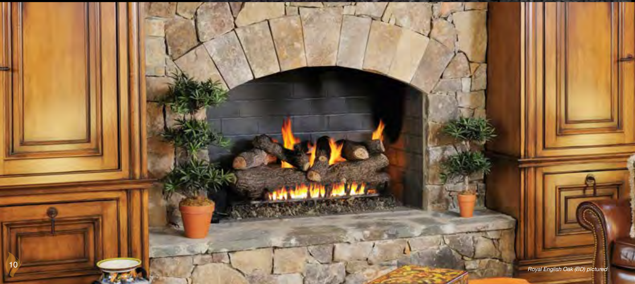
Royal English Oak (BD) pictured