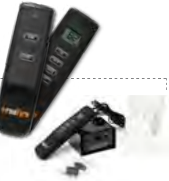
RR-2A Deluxe on/off remote control. Temperature display and thermal control function.