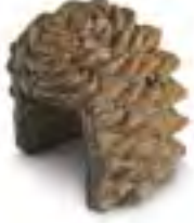
PCDC-1 Pine Cone Decor Cover (Hides remote receiver)