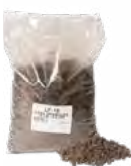
Lava-Fyre Granules • LF-10 - 10 lb. bag • LF-5 - 5 lb. bag