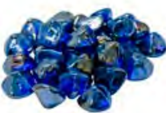
Pacific Blue (GLD-**-PB)

Also see pages 26 & 27 for burner systems for use with the Real Fyre® Diamond Nuggets