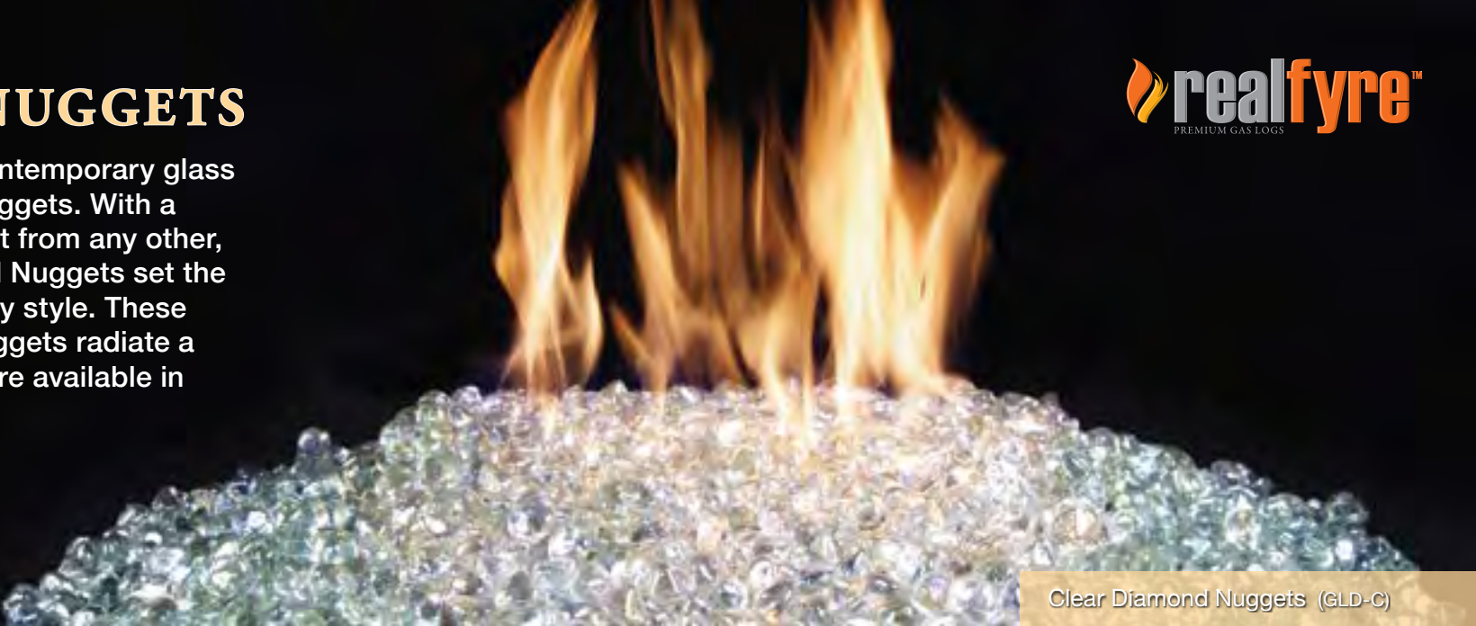
Clear Diamond Nuggets (GLD-C)

The newest shapes in contemporary glass are the new Diamond Nuggets. With a unique brilliance, distinct from any other, Real Fyre’s® icy Diamond Nuggets set the standard in contemporary style. These crystal-like oversized nuggets radiate a clean, modern feel and are available in seven glittering colors.