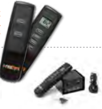
VR-2A Deluxe variable flame height remote control. Thermal control temperature display.