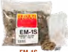
EM-1S Super Embers (Includes Bryte Coals)