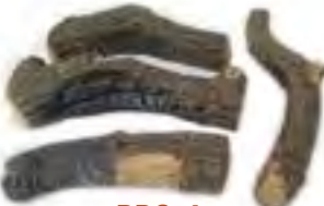
BDC-4 Charred Branches