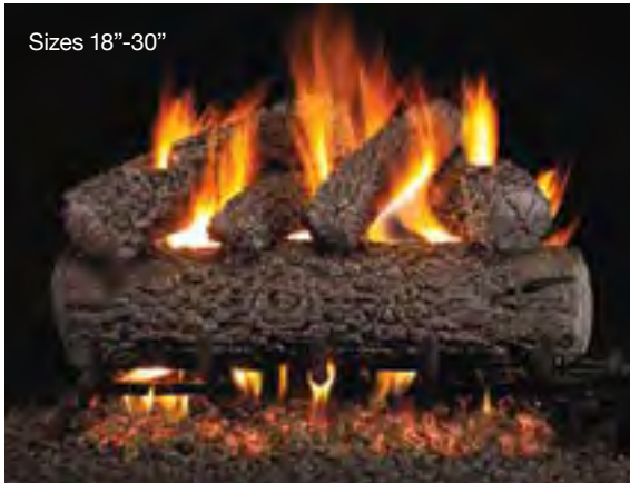
Sizes 18"-30" Post Oak (PO)