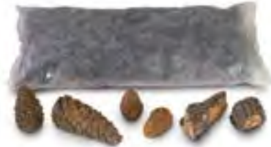
DP-7 Decor Pack (Featuring Bryte Coals)