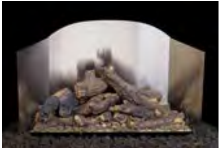
FBS-24 (Satin Stainless)