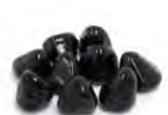
Deep Black (GLD-**-DB)

Also see pages 26 & 27 for burner systems for use with the Real Fyre® Diamond Nuggets