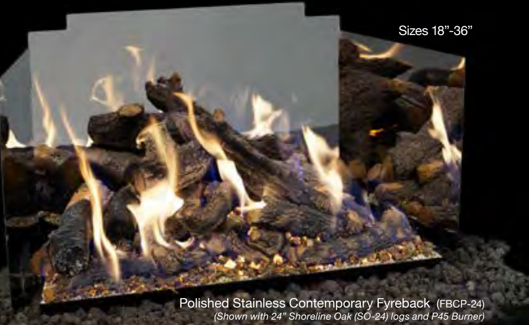
Polished Stainless Contemporary Fyreback (FBSP-24) (Shown with 24" Shoreline Oak (SO-24) logs and P45 Burner)

The Real Fyre® collection of Fyrebacks is specially designed to augment the flame reflection in your fireplace while providing a functional backdrop for your fire logs or Contemporary Alternative products. Contemporary or Traditional styles are available in either satin stainless steel, polished stainless steel, black porcelain, or a polished rose gold finish. Whether you're trying to make a dramatic statement or an understated one, Real Fyre® has the Fyreback that's perfect for any hearth.