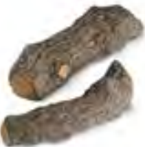
SD-BONUS Designer Bonus Logs