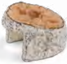
WCBC-1 Charred Birch Decorative Cover