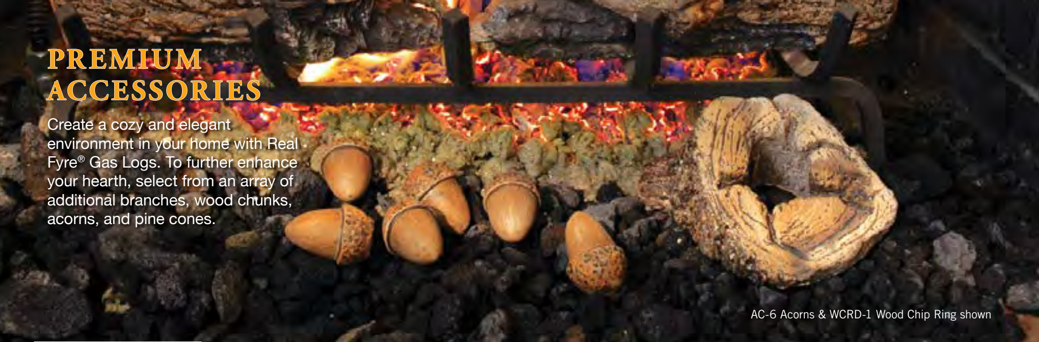
AC-6 Acorns & WCRD-1 Wood Chip Ring shown

Create a cozy and elegant environment in your home with Real Fyre® Gas Logs. To further enhance your hearth, select from an array of additional branches, wood chunks, acorns, and pine cones.