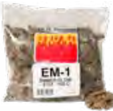
EM-1 Ember Glow