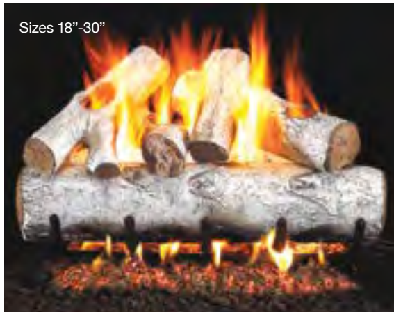
Sizes 18"-30" White Birch (W)