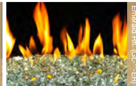
Emerald Rfl. (GL-**-ER)