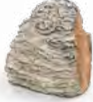
WCAB-1 Charred Birch Decorative Wood Chunk