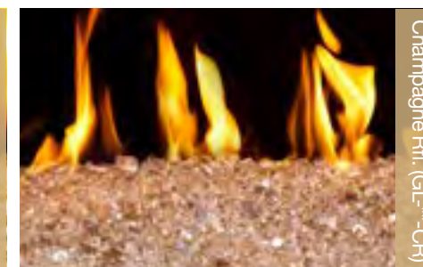
Champagne Rfl. (GL-**-CR)

Available in a 5 lb bag, a 7.5 lb bag, a 10 lb bag, a 10 lb jar, or a 40 lb container.