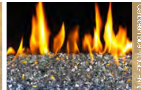
Caribbean Blue Rfl. (GL-**-NR)