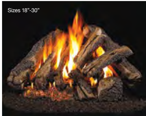
Sizes 18"-30" Western Campfire (WCF)