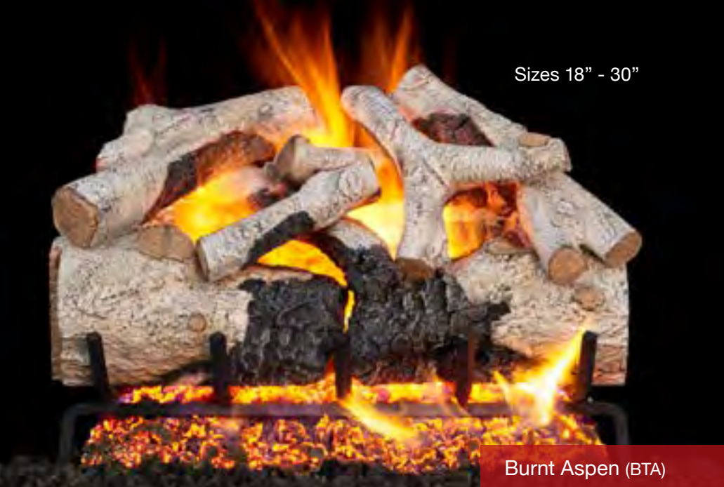
Burnt Aspen (BTA)