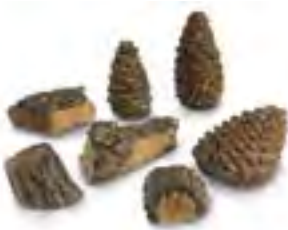
DP-2 Decor Pack