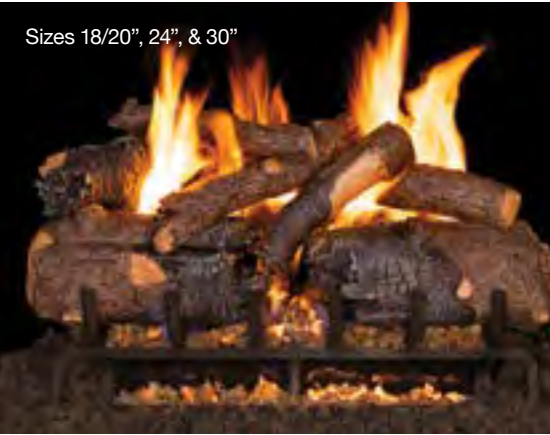
Charred American Oak (CHAO) w/G31