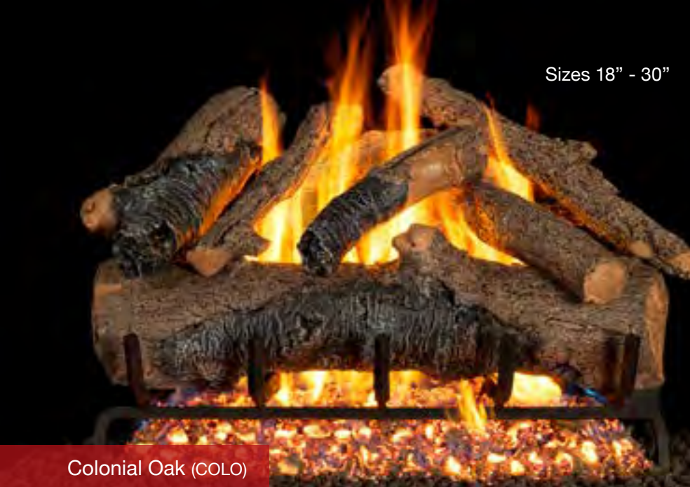
Colonial Oak (COLO)