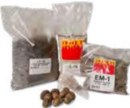
RK-1 Refresh Kit (Natural Gas)