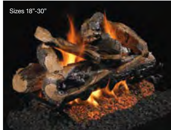
American Oak, See-Thru (AO-2-)