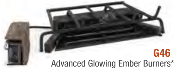
G46 Advanced Glowing Ember Burners*