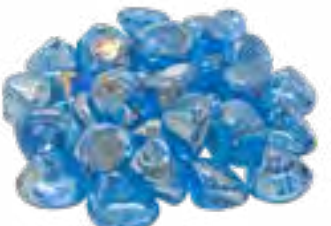
Steel Blue (GLD-**-SB)