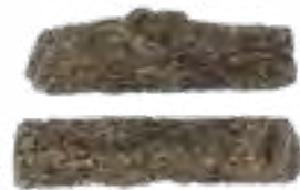
BR-2 9" Oak Branches