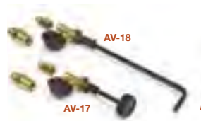
AV-17 & AV-18 Manual Valves