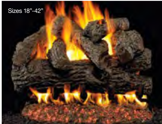
Sizes 18"-42" Royal English Oak (B)