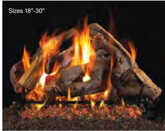
Sizes 18"-30" Woodstack (WS)