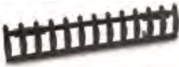
FF-04 Cast Iron Fender (18", 24", 30") (For all gas log sets)