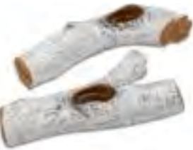
SB-BONUS Birch Bonus Logs