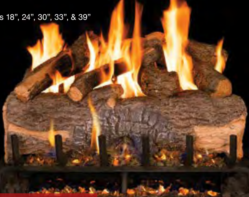
Mountain Crest Oak (MCO)