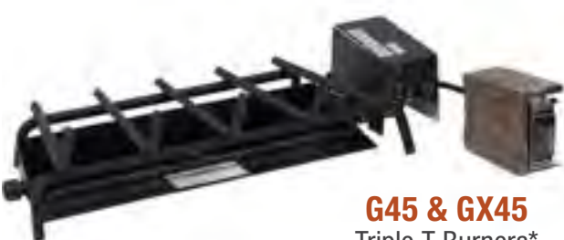
G45 & GX45 Triple T Burners*