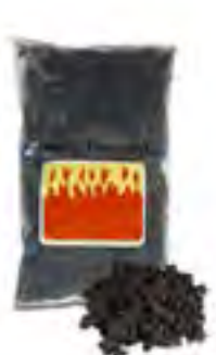
EB-1 Black Embers