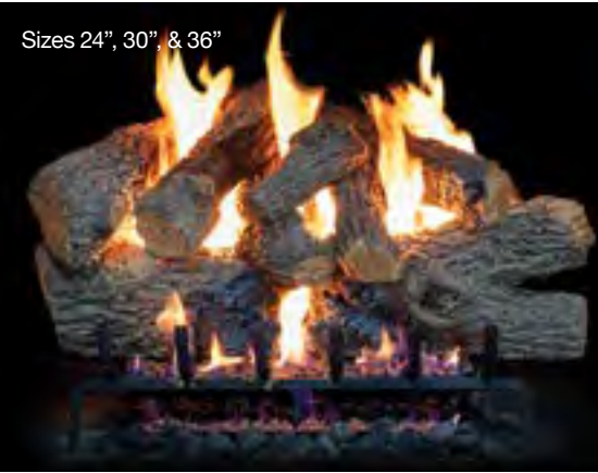
Charred Royal English Oak (CHB) w/G31