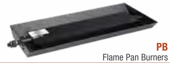
PB Flame Pan Burners