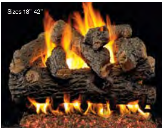
Sizes 18"-42" Royal English Oak Designer (BD)