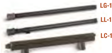
Log Lighters (Natural Gas only) • LG-1 Rigid Single Gas log lighter • LL-1 Gasaver Single Gas log lighter • LC-1 14" Cast Iron log lighter