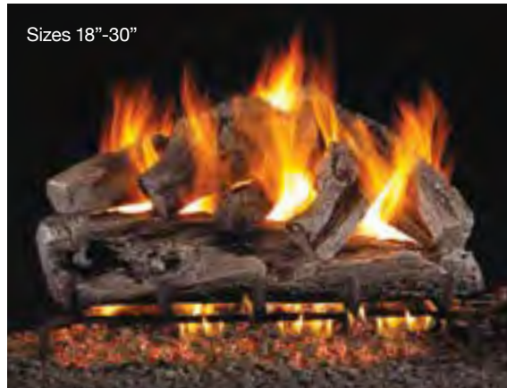
Sizes 18"-30" Rugged Oak (RRO)