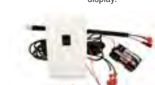
WS-3 Wall switch for log set, on/off control. Fits: APK-15 & APK-17 w/wire harness WH-01.