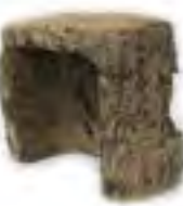
WCEC-1 Designer Valve Cover