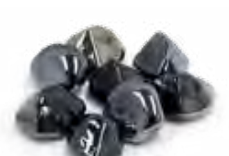
Black Luster (GLD-**-BL)