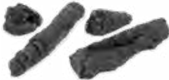
CHA-1 Charred Accessory Kit