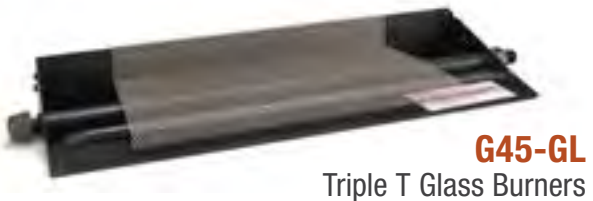
G45-GL Triple T Glass Burners