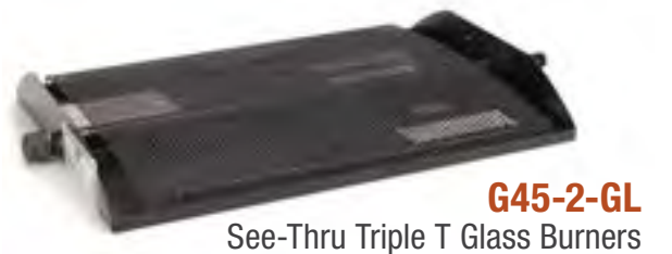
G45-2-GL See-Thru Triple T Glass Burners