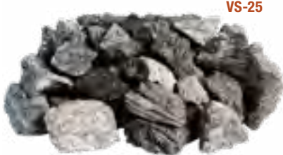
Volcanic Stones • VS-25 - 25 lb. box • VS-12 - 12 lb. box