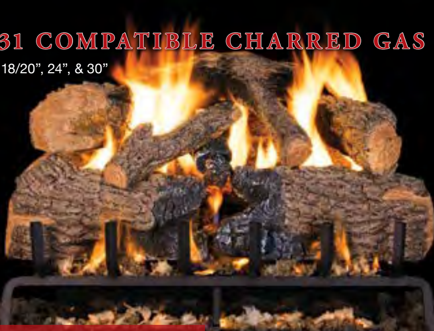
Charred Angel Oak (CHNA) w/G31