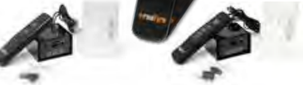
RR-1A Standard on/off remote control.