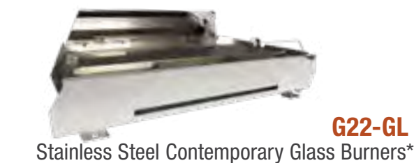
G22-GL Stainless Steel Contemporary Glass Burners*