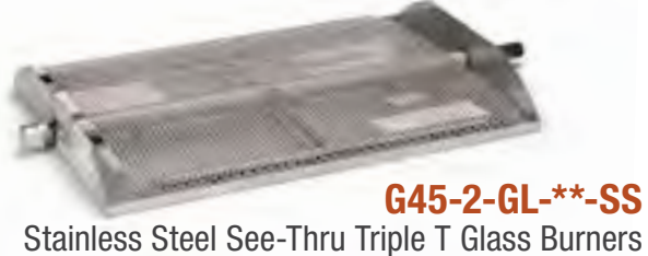
G45-2-GL-**-SS Stainless Steel See-Thru Triple T Glass Burners