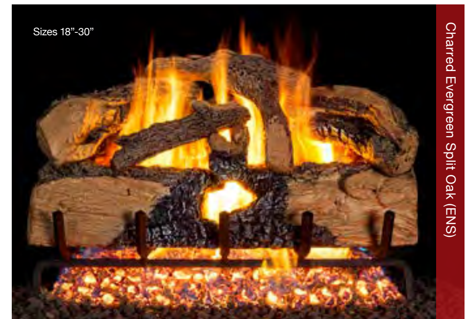
Charred Evergreen Split Oak (ENS)

All G52 log sets are molded with an exclusive fiber enhanced refractory ceramic mixture which provides a brighter glow and more intense radiant heat. These logs are only compatible with the G52 Burner System only.