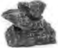
CHC-01 Charred Series Chunk