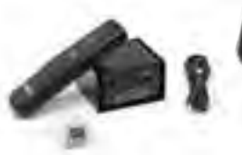
VR-1A Standard variable flame height remote control.