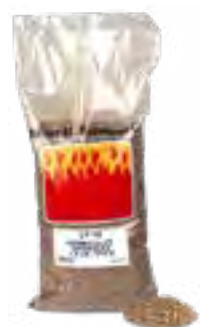
LF-15 Vermiculite Granules