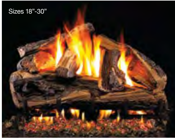
Sizes 18"-30" Rugged Spit Oak (RRSO)