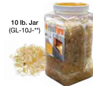
10 lb. Jar (GL-10J-**)