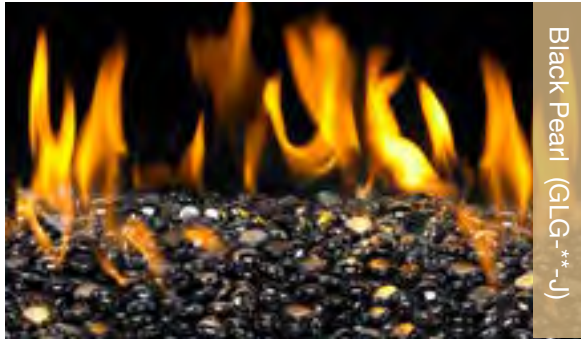
Black Pearl (GLG-**-J)