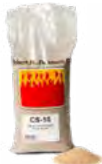
CS-10 Select White Sand (10 lb. bag)