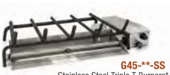
G45-**-SS Stainless Steel Triple T Burners*

*These burners are shown with optional control system.