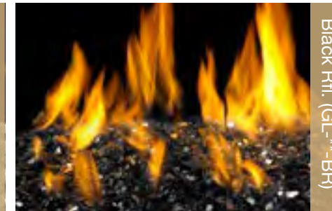
Black Rfl. (GL-**-BR)