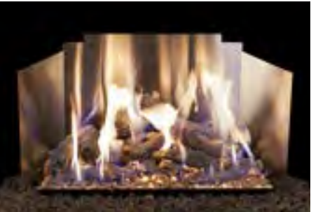
FBC-24 (Satin Stainless)