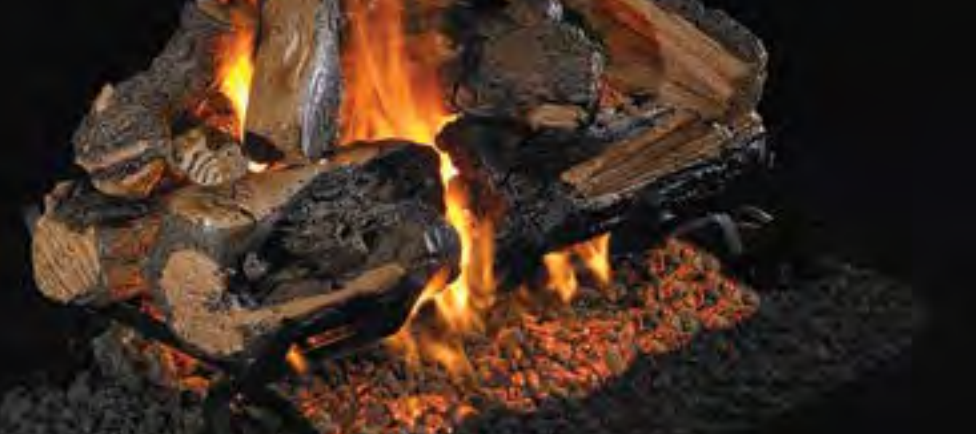
Charred Rugged Split Oak, See-Thru (CHRRSO-2-)