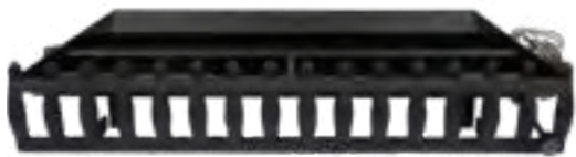
Optional Decorative Front Fender