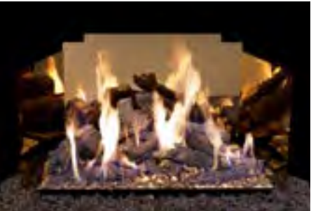
FBCG-24 (Rose Gold)