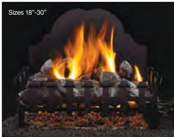
Sizes 18"-30" Old English Coal Grate (V)