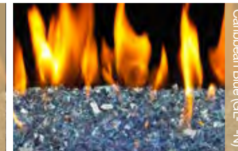
Caribbean Blue (GL-**-N)