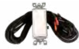
WS-1 Wall switch for log set, on/off control.