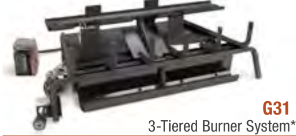
G31 3-Tiered Burner System*