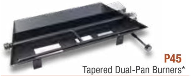
P45 Tapered Dual-Pan Burners*