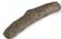
BR-17 17" Oak Branch