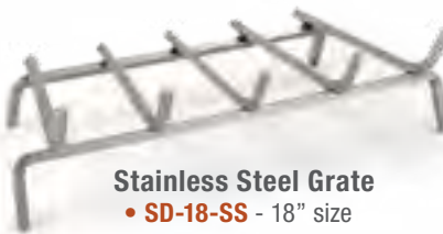
Stainless Steel Grate • SD-18-SS - 18" size • SD-24-SS - 24" size • SD-30-SS - 30" size