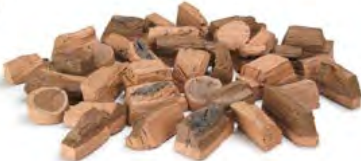
WCD-36 36-Pc. Designer Wood Chunks