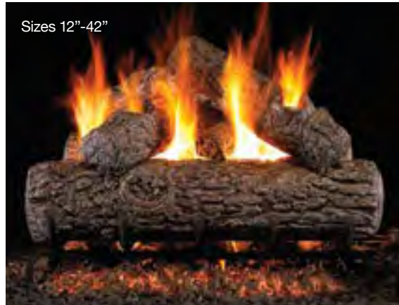
Sizes 12"-42" Golden Oak (R)