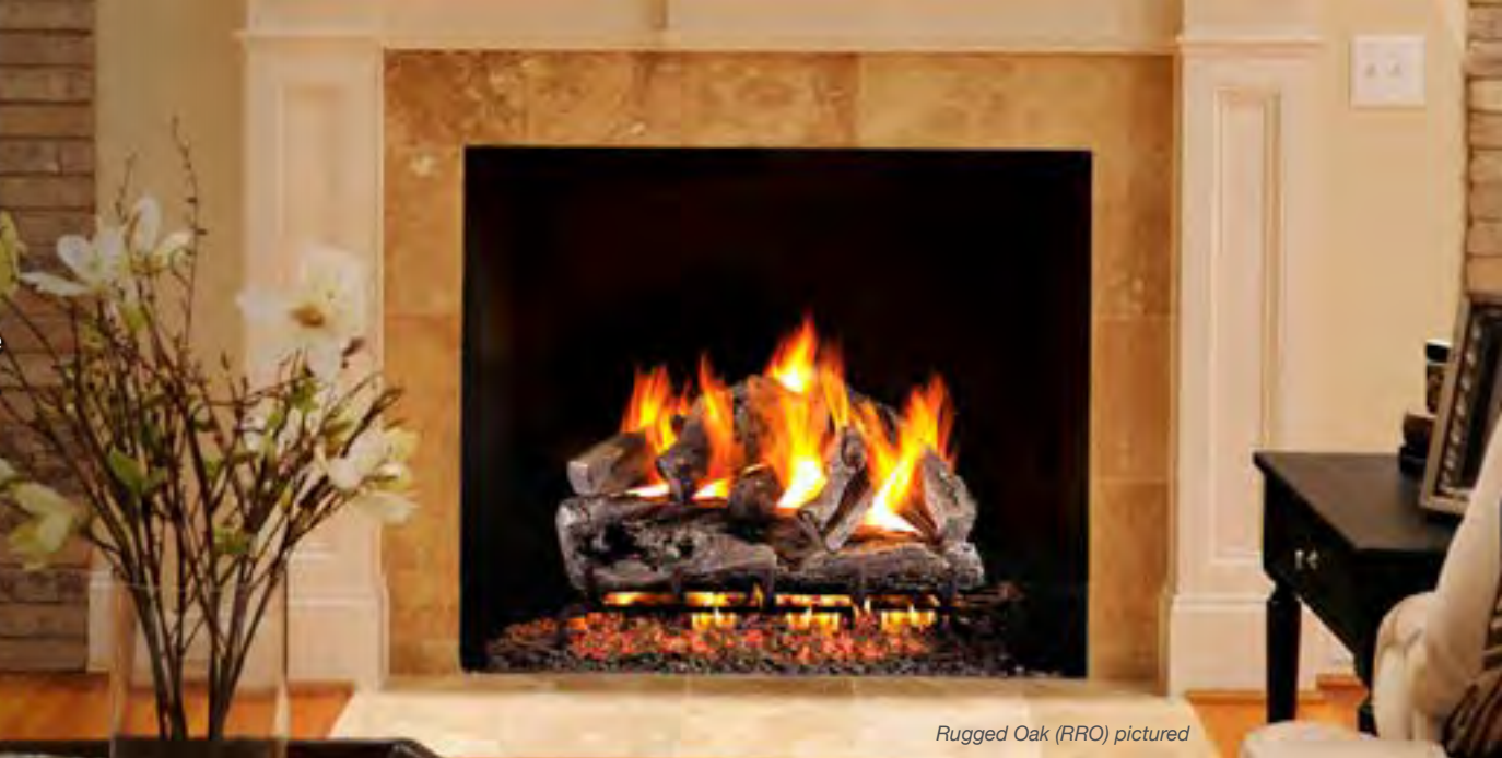
Rugged Oak (RRO) pictured

Experience the Classic Series from Real Fyre® and experience what's new again.