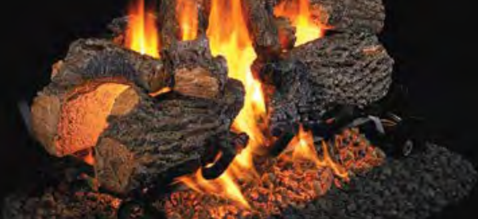
Charred Oak, See-Thru (CHD-2-)