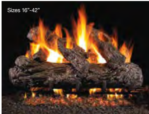
Sizes 16"-42" Rustic Oak (HR)