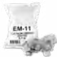
EM-11 Bryte Coals