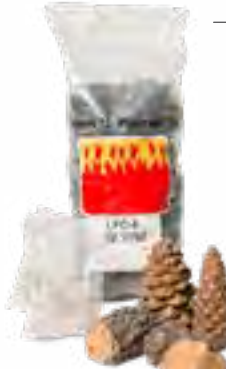
DP-5 Decor Pack