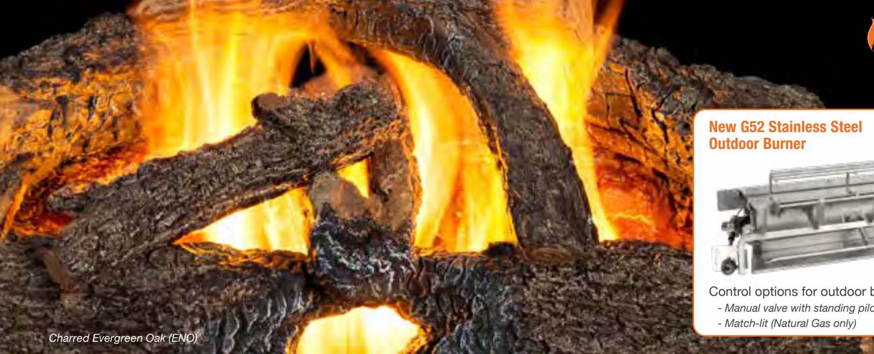
Charred Evergreen Oak (ENO)