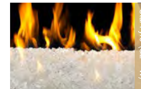
Star Fyre (GL-**-W)