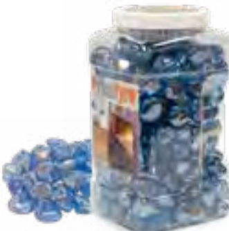
10 lb. Jar (GLD-10J-**)

Available in a 5 lb bag, a 7.5 lb bag, a 10 lb bag, a 10 lb jar, or a 40 lb container. NOTE: COLORS MAY VARY FROM THOSE SHOWN IN PHOTOS.