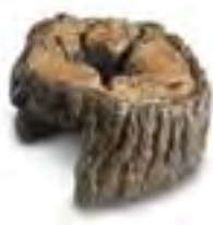
WCDC-1 Wood Chunk Decor Cover (Hides remote receiver)