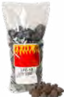
LFC-10 Lava-Fyre Coals (10 lb. bag)