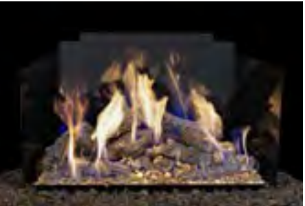
FBCB-24 (Black Porcelain)