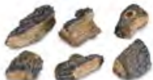
WOOD CHIPS: WCH-6 Charred WC-6 Designer