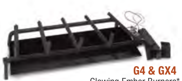
G4 & GX4 Glowing Ember Burners*

Every Real Fyre™ gas log set that has a factory-attached Remote Control System (APK's and EPK's) has a Decorative Heat Shield to conceal the Remote Receiver/Switch Box located inside or outside the fireplace and to provide longer life for the unit and batteries.