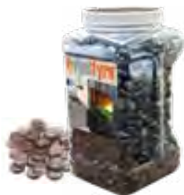
10 lb. Jar (GLG-10J-**)

Fyre Gems are designed so that your fireplace will glow and sparkle in a sea of vibrant, glistening flame. Their rounded and smooth surfaces reflect the fire, providing a unique hearth experience. Each Fyre Gem is approximately 5/8” in diameter and is manufactured to withstand the extreme heat and temperature variations in the fireplace without melting or discoloring. Choose one or several of our many available colors to customize your fireplace or outdoor fire feature.