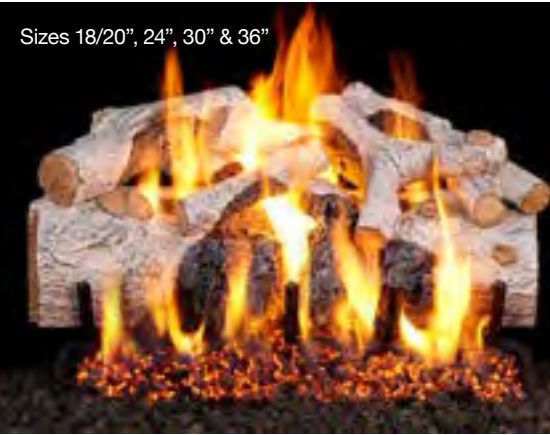
Charred Mountain Birch (CHMBW)