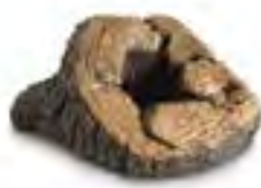
WCRD-1 Wood Chip Ring