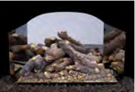
FBSP-24 (Polished Stainless)