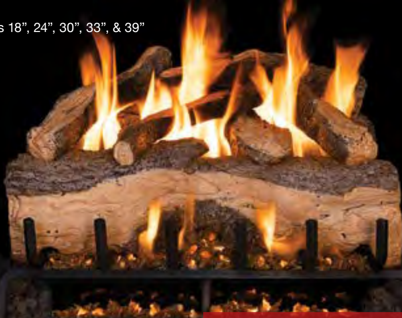
Mountain Crest Split Oak (MCS)