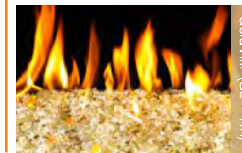
Gold Rfl. (GL-**-HR)