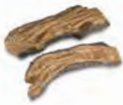
SS-BONUS Split Bonus Logs