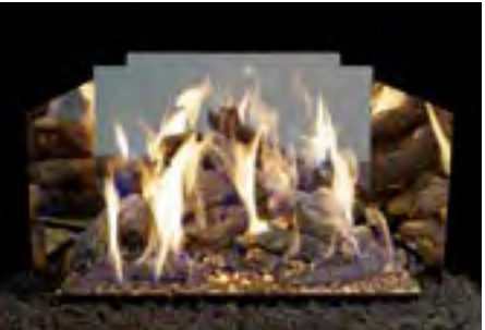
FBSP-24 (Polished Stainless)