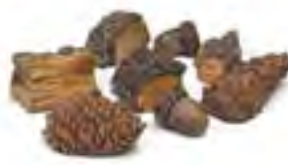
HDK-1 Decor Pack