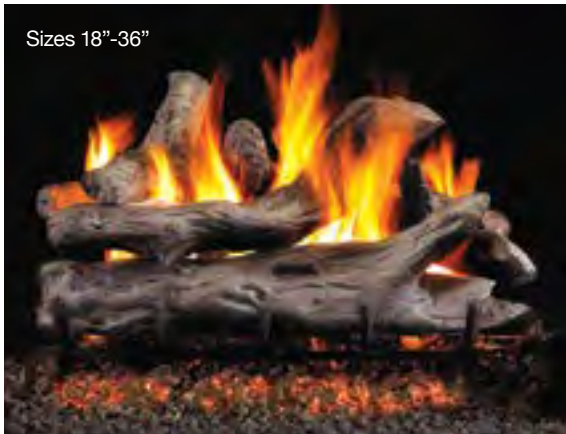
Sizes 18"-36" Coastal Driftwood (CDR)