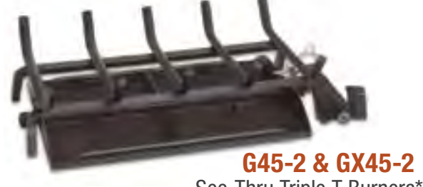
G45-2 & GX45-2 See-Thru Triple T Burners*