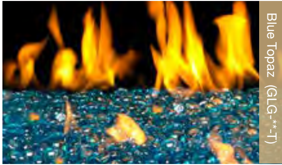
Blue Topaz (GLG-**-T)