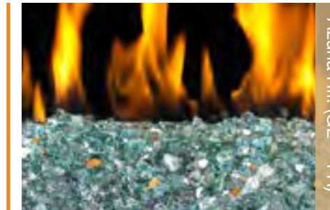
Azuria Rfl. (GL-**-FR)