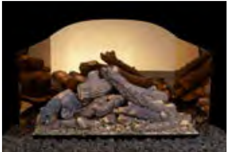
FBSG-24 (Rose Gold)