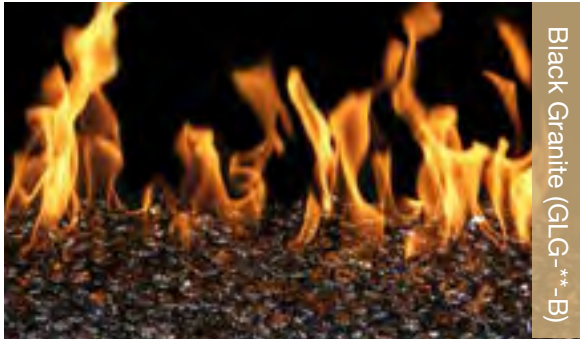
Black Granite (GLG-**-B)