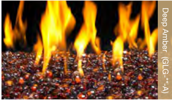
Deep Amber (GLG-**-A)