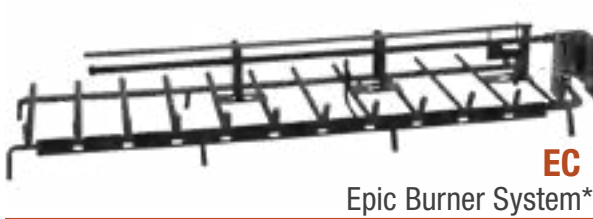
EC Epic Burner System*