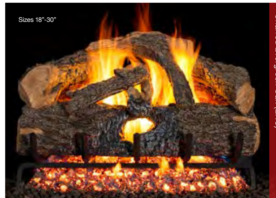
Charred Evergreen Oak (ENO)