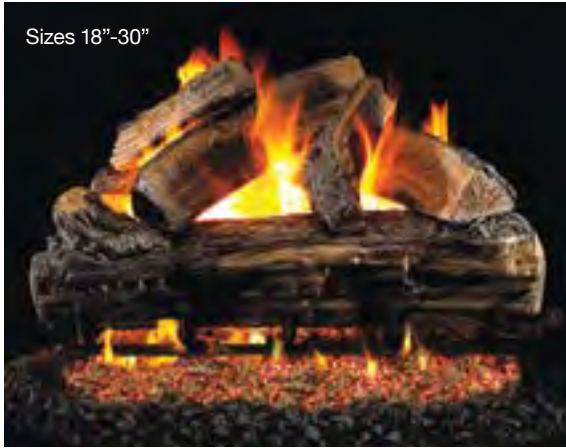
Sizes 18"-30" Spit Oak (S)