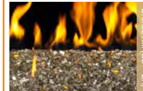
Bronze Rfl. (GL-**-ZR)