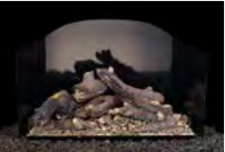
FBSB-24 (Black Porcelain)