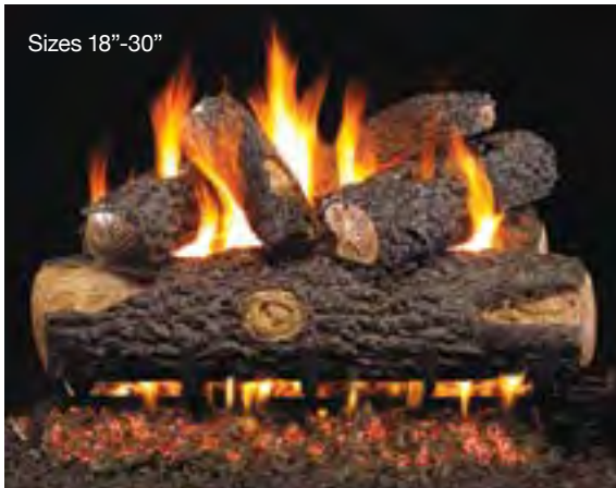
Sizes 18"-30" Woodland Oak (WO)