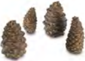
PC-4 Designer Pine Cones