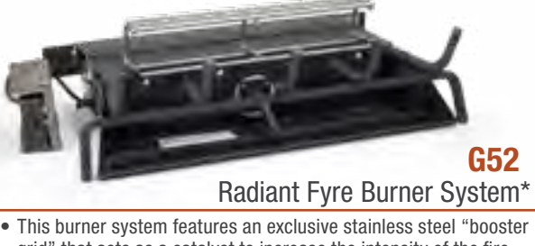
G52 Radiant Fyre Burner System*