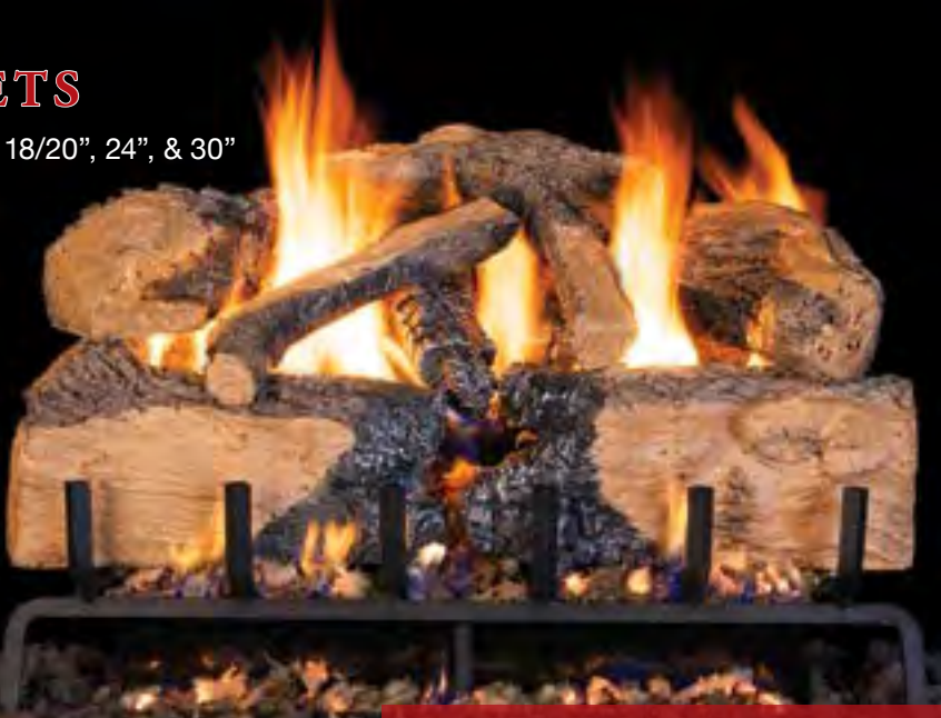
Charred Angel Split Oak (CHNS) w/G31