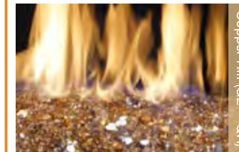
Copper Rfl. (GL-**-QR)