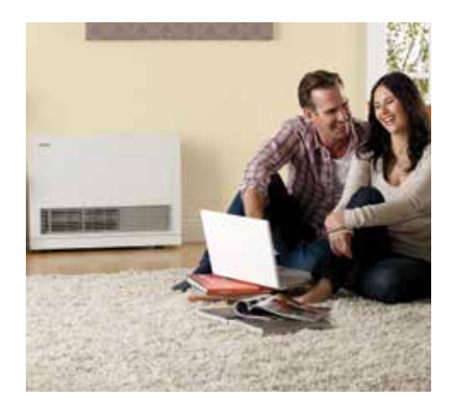
Comfortable heat for hard-to-heat spaces